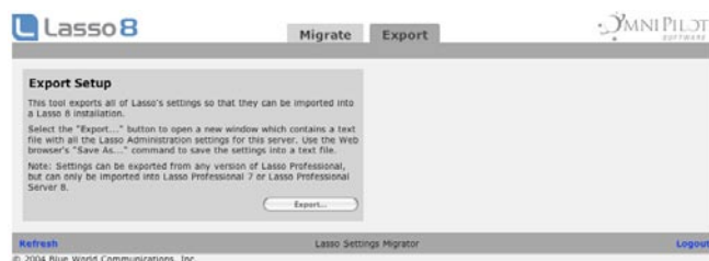
Figure 3: Export Section